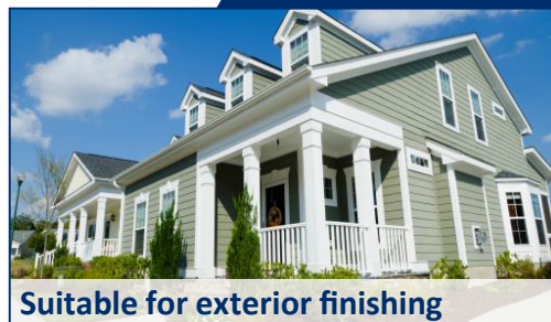
Suitable for exterior finishing